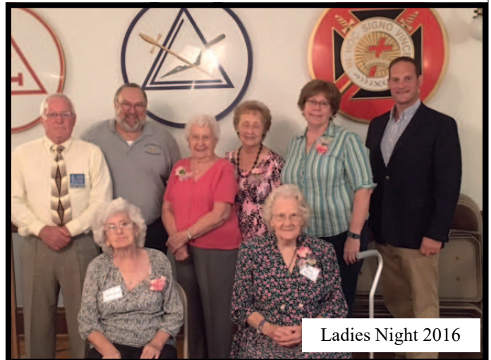
Ladies Night 2016