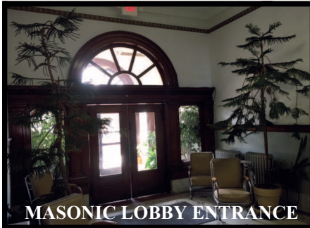
MASONIC LOBBY ENTRANCE