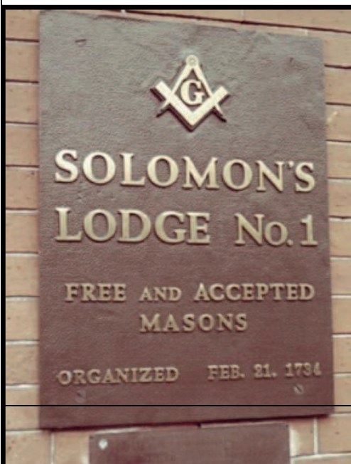
Masonry in Pictures