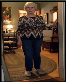
Plants courtesy of Bettie Freidman