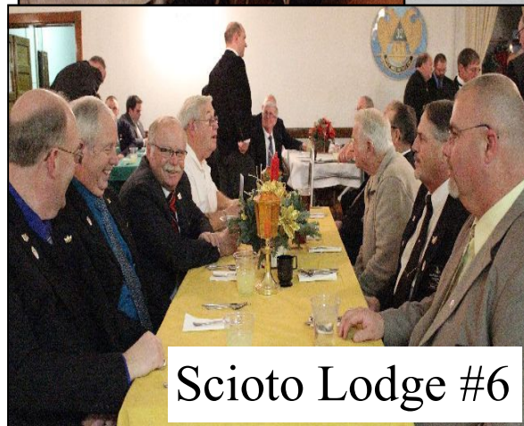
Scioto Lodge #6