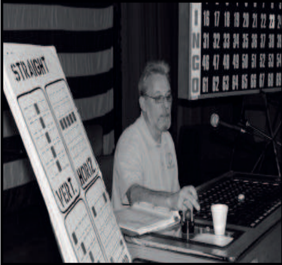
Seventh Masonic District Association Seventh Masonic District Veterans' Bingo Event

These pictures are from the photo achieve.