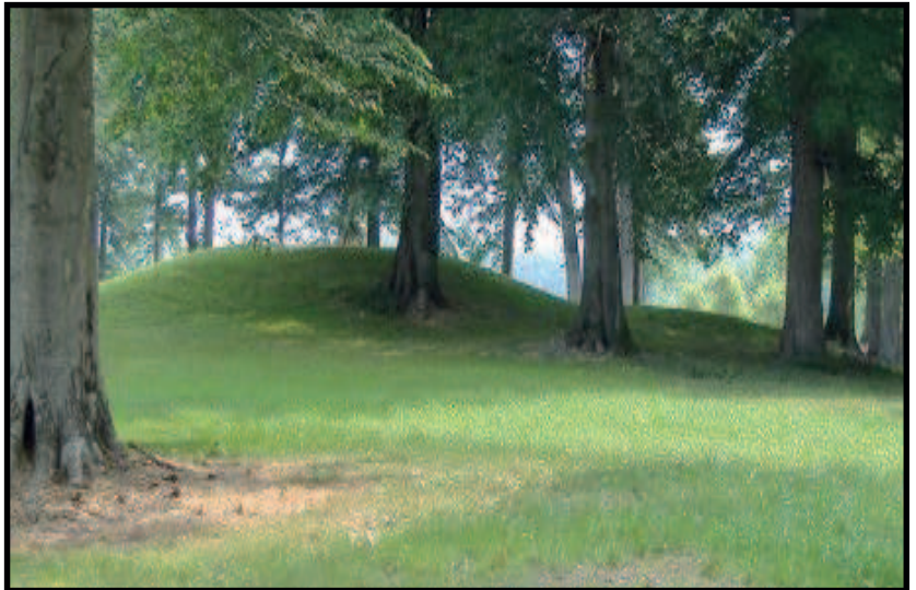
Fort Salem Earth Works