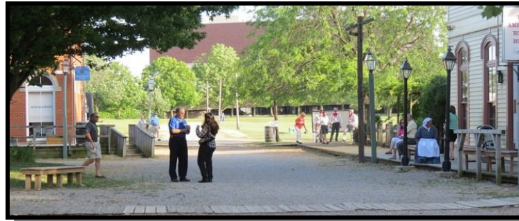
Main Street in the Ohio Village