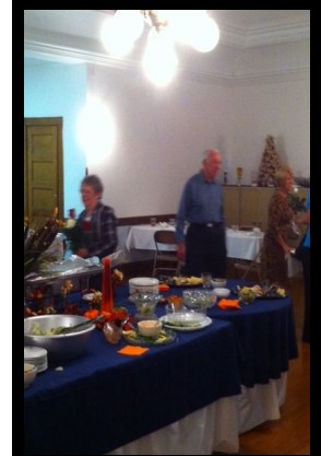
Moll Dining Room Ladies and Widows Night Banquet