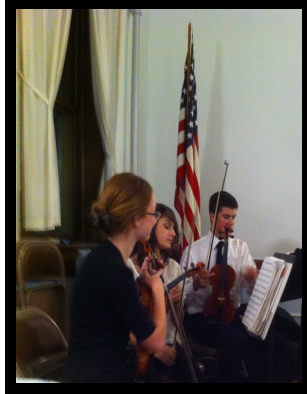
The Chillicothe High School String Ensemble