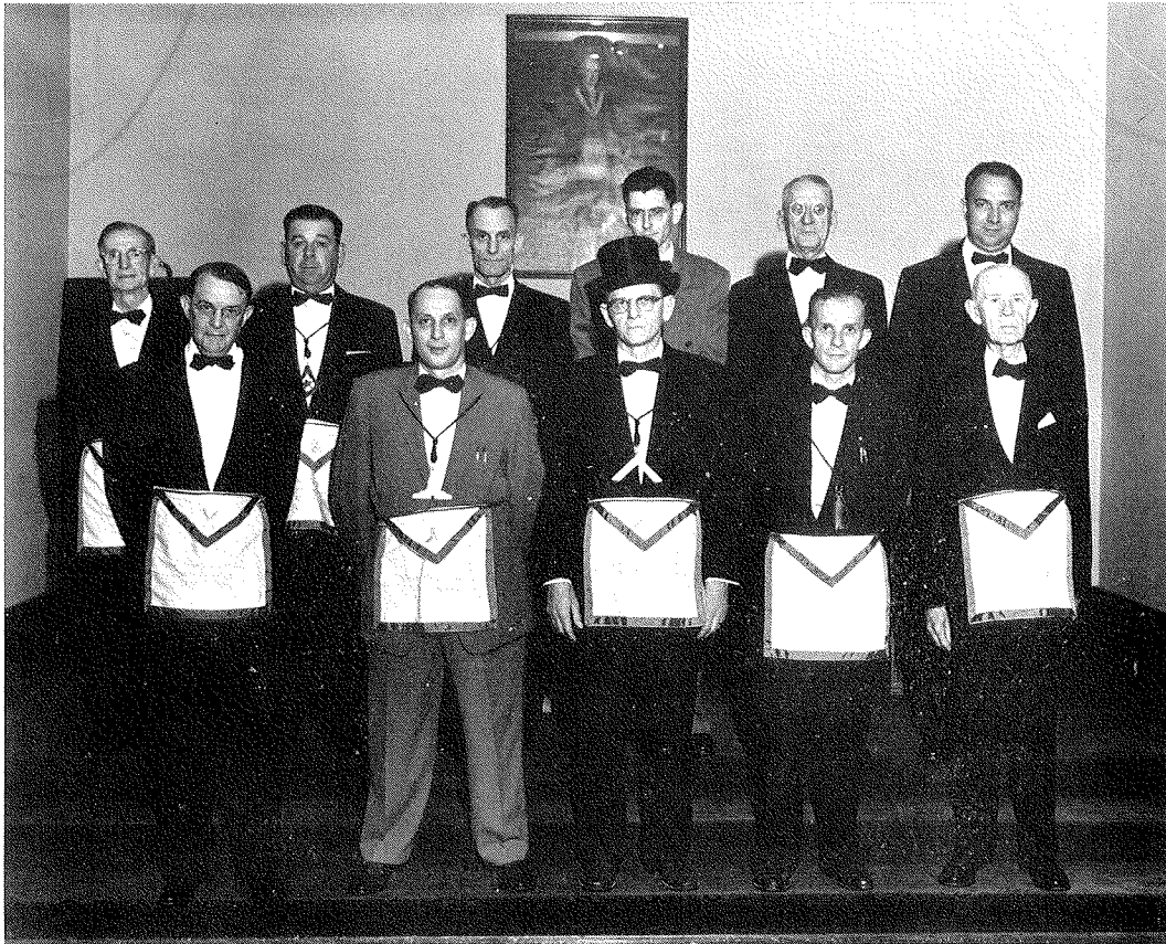
OFFICERS OF SCIOTO LODGE No. 6, 1954-1955